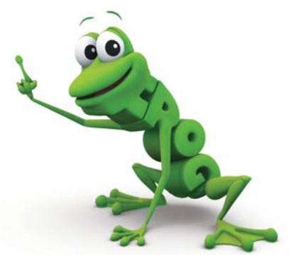
The WordWorld frog embodies spatial contiguity (but he's also quite distracting!)

Pair words with pictures rather than use words alone [Multimedia] ✓ Organizational and explanative pictures ✗ Decorative and representational pictures Communicate in a conversational style [Personalization, Voice] Demonstrate with human movement [Image] Demonstrate with worked examples (Renkl)